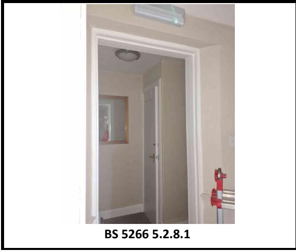
BS 5266 5.2.8.1