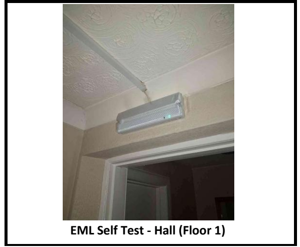
EML Self Test - Hall (Floor 1)